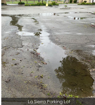
La Sierra Parking Lot