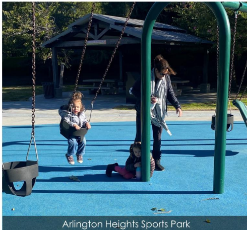
Arlington Heights Sports Park