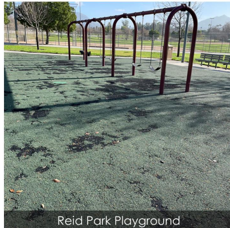
Reid Park Playground