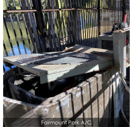
Fairmount Park A/C