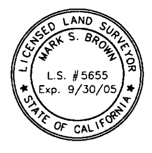
License Expires 9/30/05

The City of Riverside makes no warranty as to discrepancies, defects, or conflicts in boundary lines, shortage in area, encroachments, adverse claims, or any other facts that a correct survey and/or research of public records would disclose.