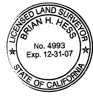
1'' = 100'