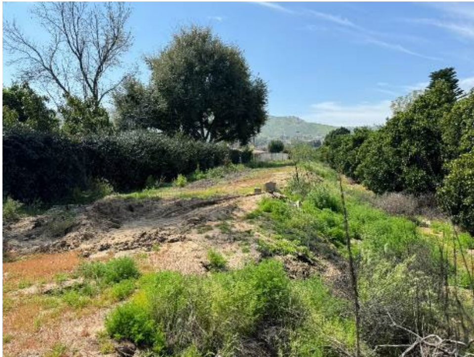
Photo 2: Southwest-facing view of the southern portion of the Project site.