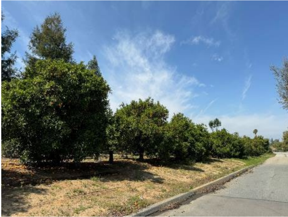
Photo 1: West-facing view of the northern portion of the survey area off Millsweet Place.