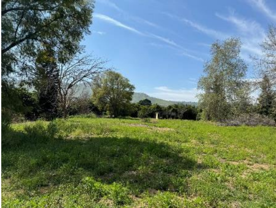
Photo 3. West-facing view of the middle portion of the Project site.