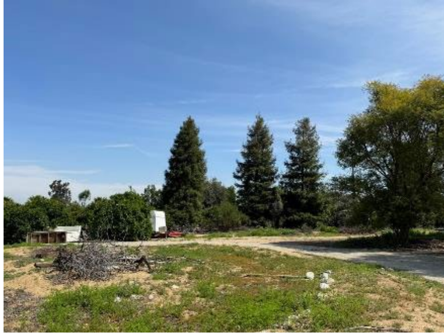
Photo 5. North-facing view of middle portion of the Project site depicting developed land and large pine trees.