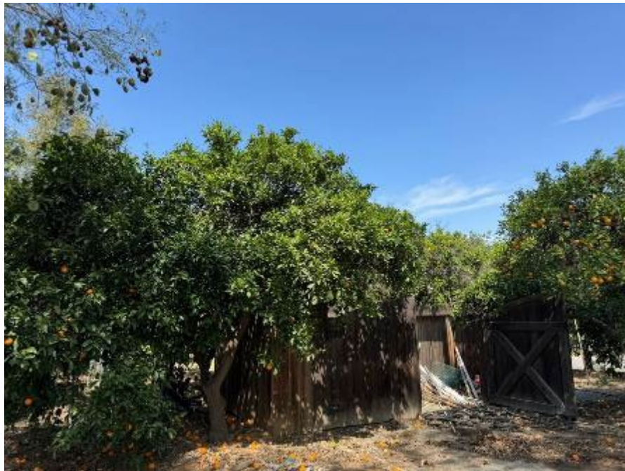
Photo 6. East-facing view of citrus trees on the southeast corner of the Project site.