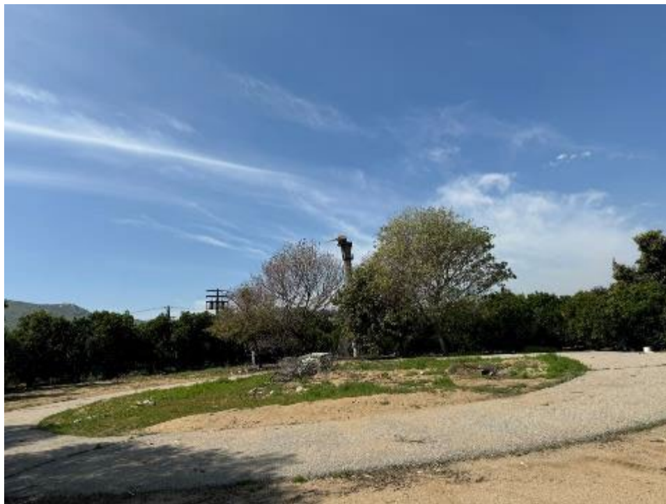
Photo 4. North-facing view of middle portion of the Project site depicting the citrus orchard in the background.