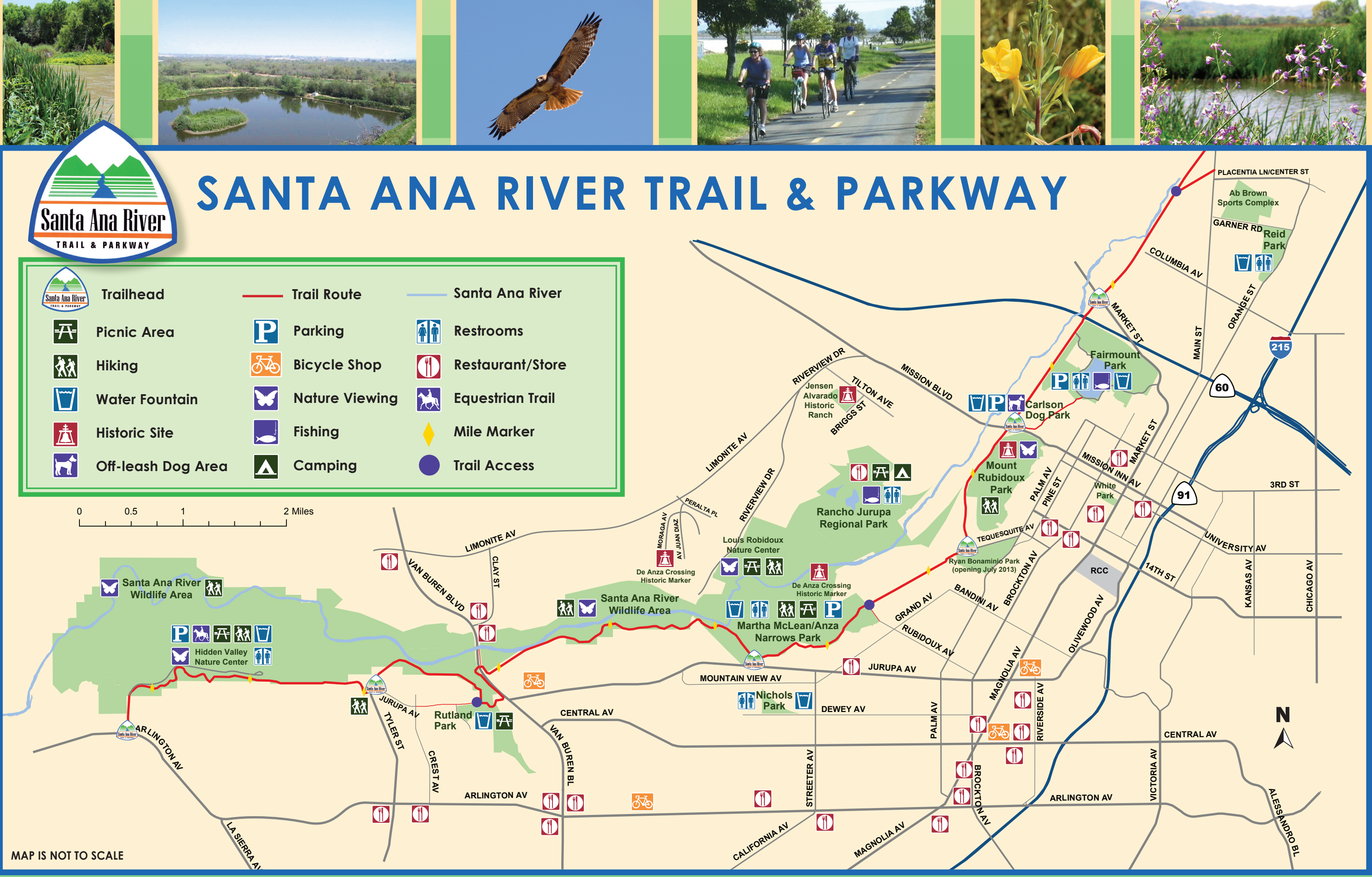
All City or County Parks shown have varying hours, regulations and fees may apply. State license required for fishing. Weekday users may experience some construction/detour changes to the route. This map is intended for general information only and is subject to change without notice. It is recommended that users call ahead for verification before visiting a particular site. For more information call the Clty of Riverside information and services line at 826-5311.