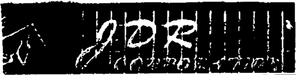
ILLUSTRATION OF EXHIBIT "C" 12674