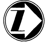
EXHIBIT 'B' STORM DRAINAGE EASEMENT PORTION OF PARCEL 5