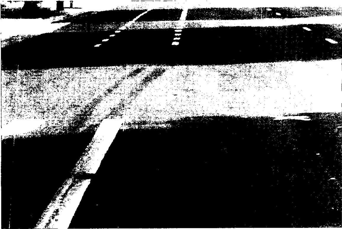
Well TOC-23 in Southbound Lane of Market Street (View North) 68 Feet North of North Curb Face of 14th Street and 19 Feet East of West Curb Face of Market Street