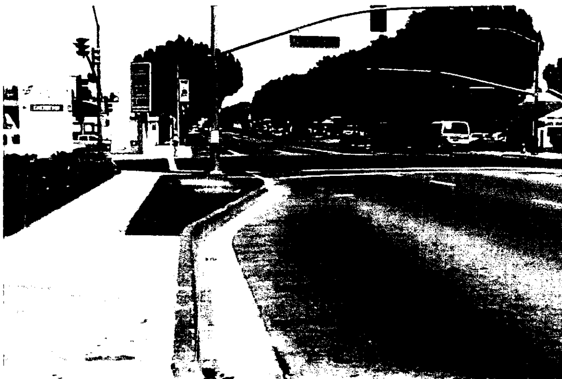
Well TOC-22 located in Market Street (View North) 50 Feet South of South Curb Face of 14th Street and 7 Feet East of West Curb Face of Market Street