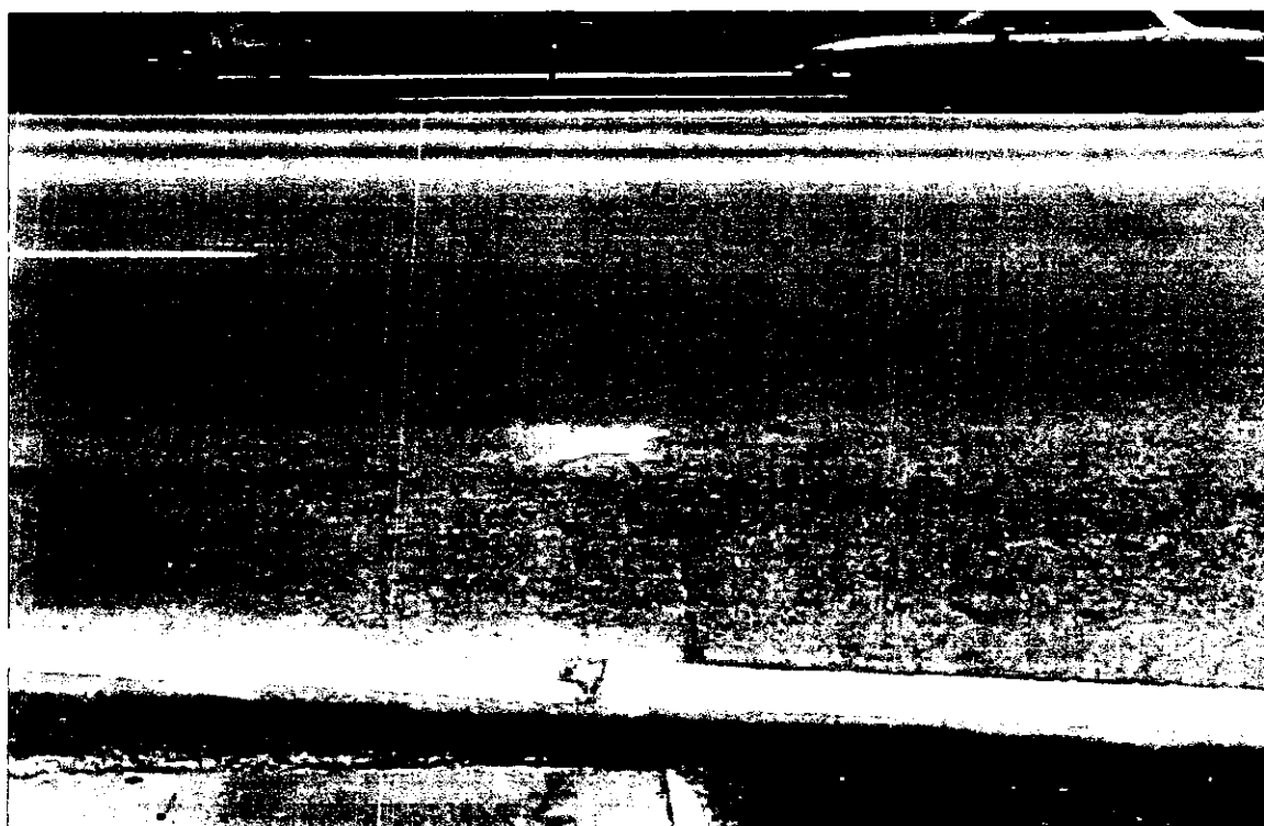
Well TOC-22 (View East)