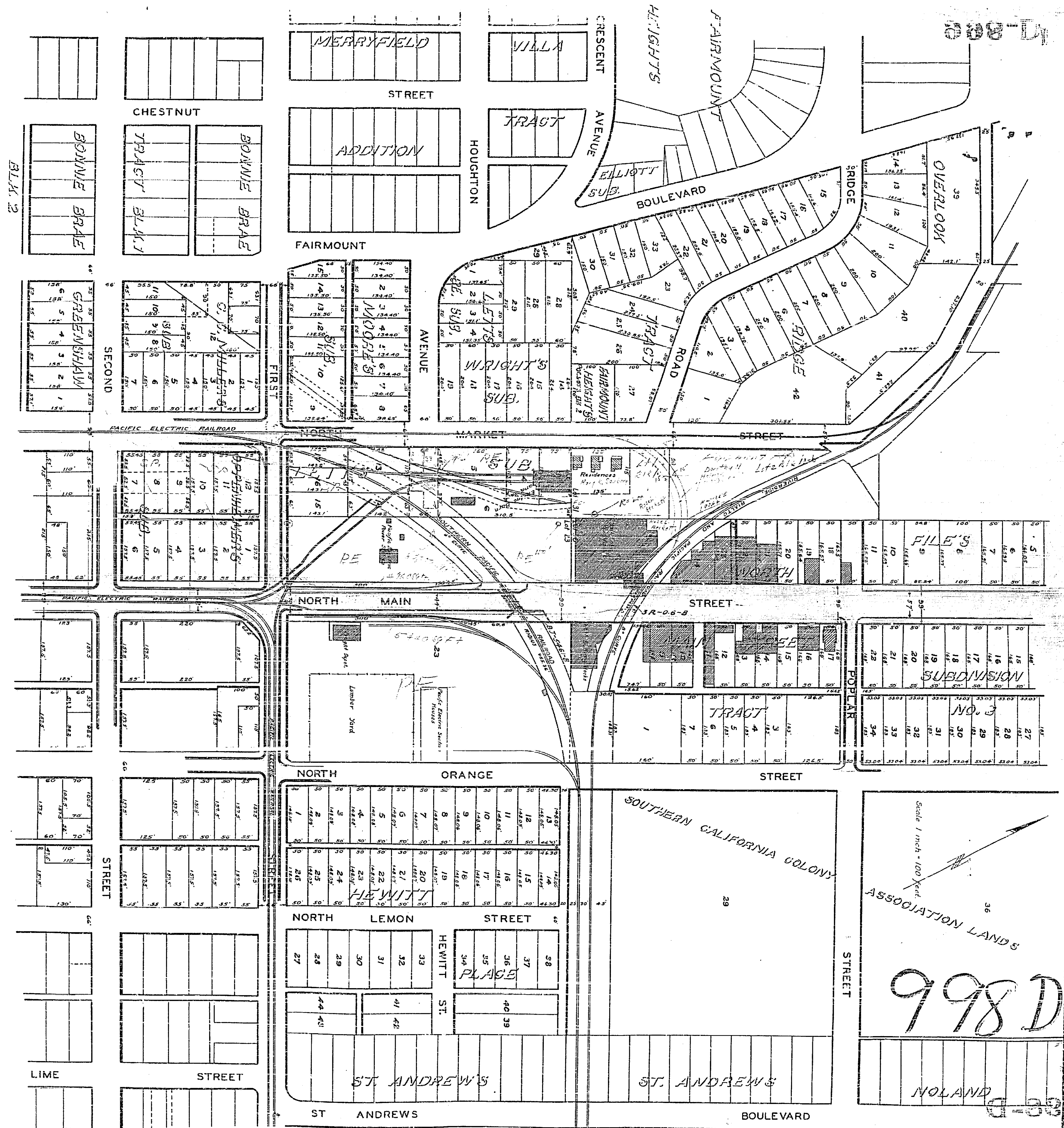
MAP OF A PORTION OF THE CITY OF RIVERSIDE SHOWING STREETS AND BUILDINGS IN THE IMMEDIATE VICINITY OF NORTH MAIN STREET AND SOUTHERN PACIFIC RAILROAD ENGINEERING DEPARTMENT CITY OF RIVERSIDE