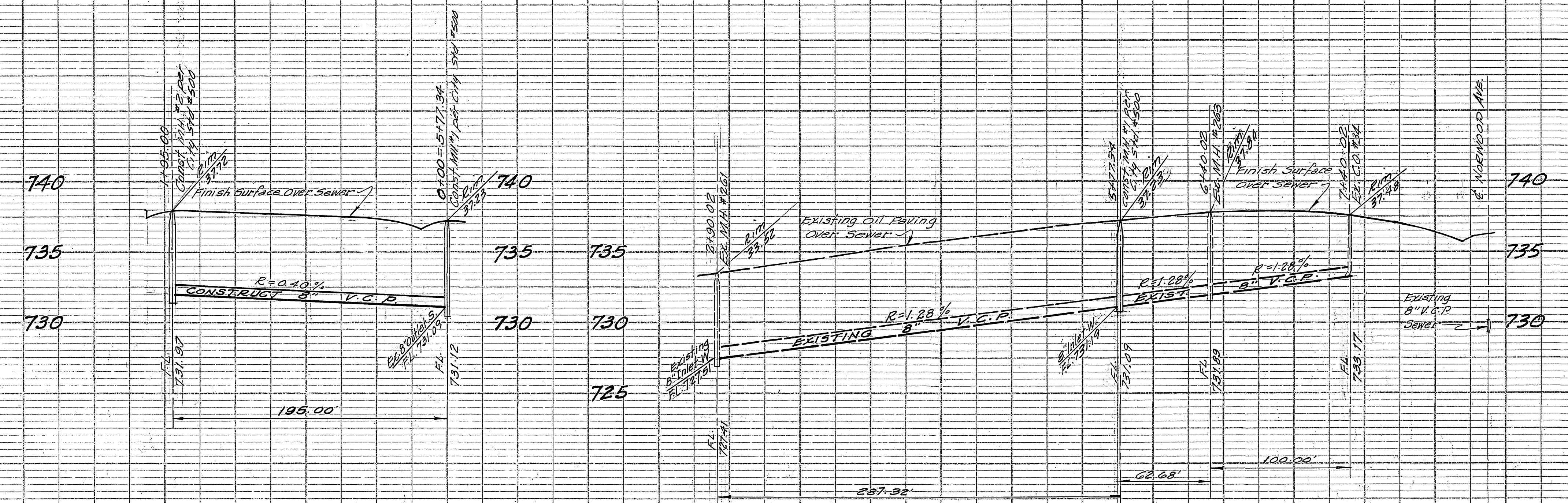
SEWER PROFILE SCALE: 1 in. = 50 ft. Horiz. 1 in. = 5 ft. Vert.