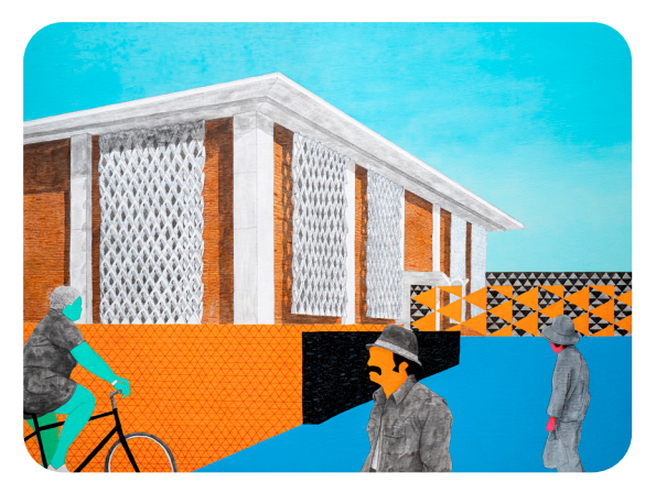
James McClung, The Cheech, 2021, courtesy of the Riverside Art Museum.